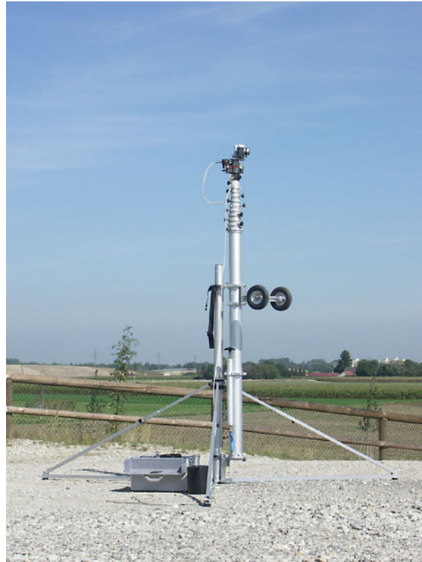
Pneumatic telescoping mast installed in the tripod base prior of being extended