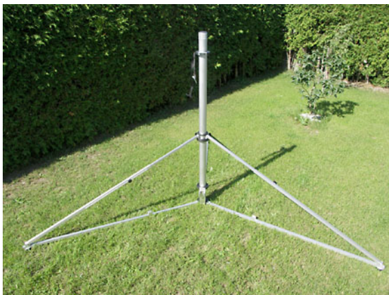
PT 75H ... 105SH Tripod Base