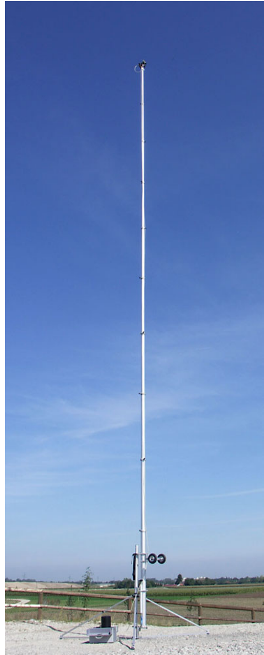
Pneumatic mast with tripod base (identical constructions as PT 75H / PT 90H)

The pneumatic telescoping masts feature a 24 mm (DIN) receptacle. Adapters for popular lighting systems are available as accessories.